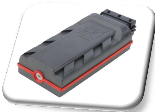
Diesel Power Module

Module Setting: Recommend “9” Setting for Optimal Performance.