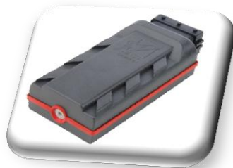
Diesel Power Module

Estimated time of Installation: 45 minutes.