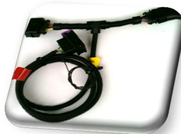
Diesel Power Harness