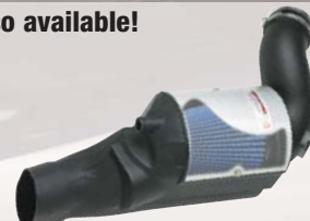
Stage 2 Cold Air Intake System (P/N 54-10392 & 75-10392)