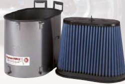
Stage 1 Cold Air Intake System (P/N 54-10391 & 75-10391)